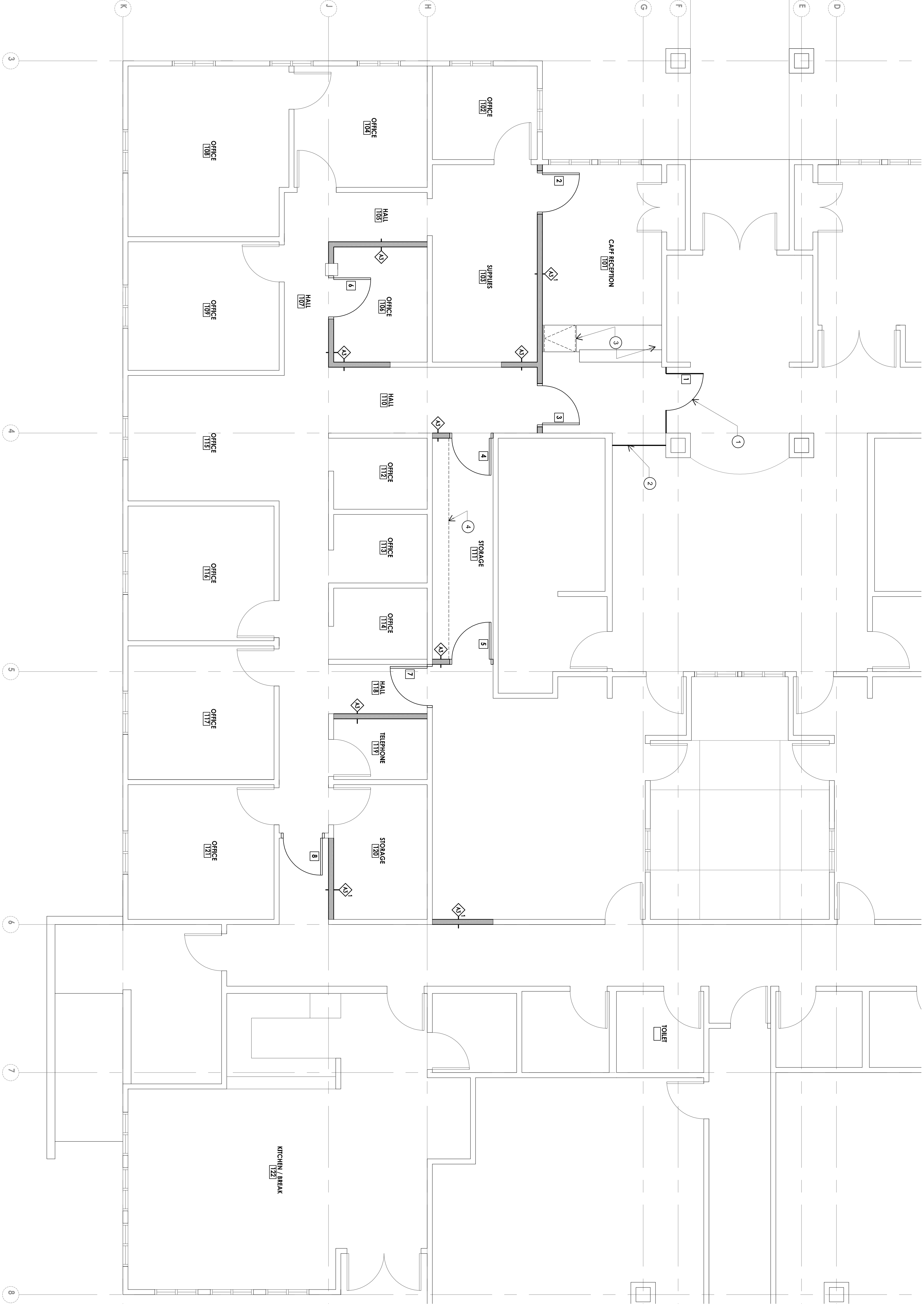
GROUND FLOOR - FLOOR PLAN SCALE: 1/4"=1'-0"